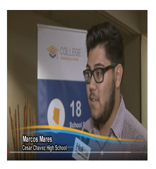
Video: Helios is helping to build a college going culture at high